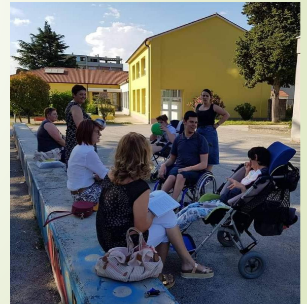
In front of the school „Liče Faraguna”