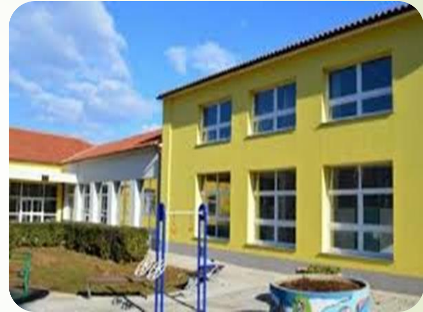
School „Liče Faraguna”