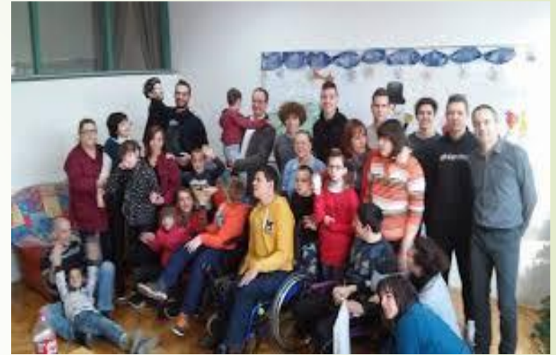
Students and staff members , „Liče Faraguna”